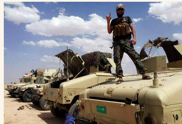
Millions of dollars' worth of American military gear is now in the hands of ISIS Jihadists.