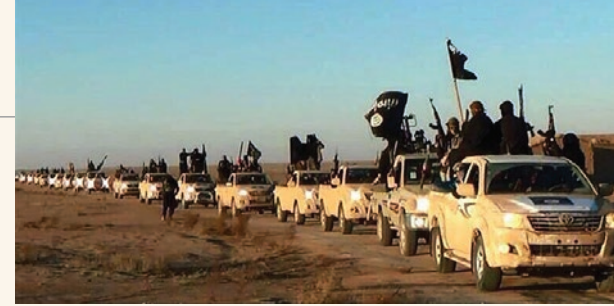
Convoys of ISIS terrorists driving expensive cars entered Iraq without being noticed by US intelligence groups.

Sadly, looking back at the saga of Iraq in the beginning of the 21st century, the US wasted an opportunity. President Obama entered the White House and decided to withdraw US forces from Iraq, after the previous president had reached an agreement with the Iraqi government to leave behind a force of 20,000 American soldiers when America left Iraq in 2011. This force was to include army instructors and intelligence experts whose job was to assist the Iraqi government in keeping control of the