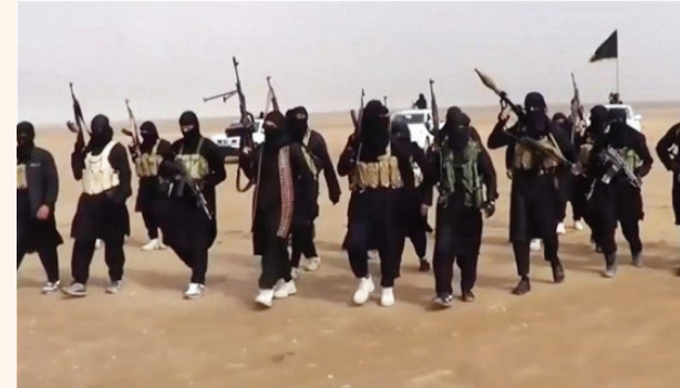
ISIS fighters advancing into Iraq.