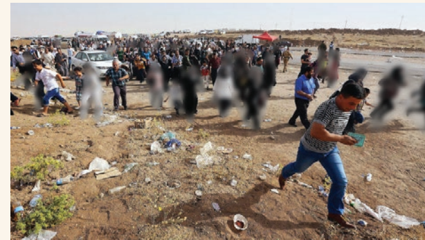
Civilians fleeing the murders and kidnappings by the Islamic extremists who took over Mosul.