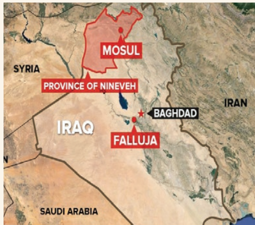
Top: Territory overrun by ISIS as of June 2014. Bottom: First areas of Iraq that were conquered by ISIS forces (in red).

began raking in millions of dollars after capturing oil-rich cities in nearby Syria in 2012. Since capturing Mosul, ISIS has multiplied its wealth fourfold by plundering the central bank. Add to that tens of millions of dollars' worth of American military equipment, including tanks, trucks, armor and weapons that Iraqi troops abandoned in the chaos of their flight, and the group's value is assessed at $2 billion!