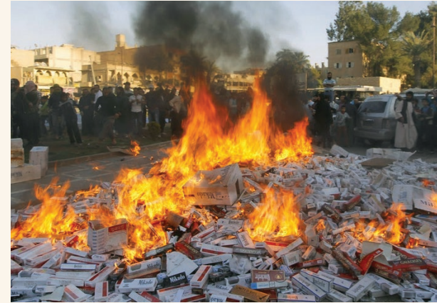
Muslim radicals from ISIS burning loads of cigarettes while implementing strict Sharia law throughout the land.